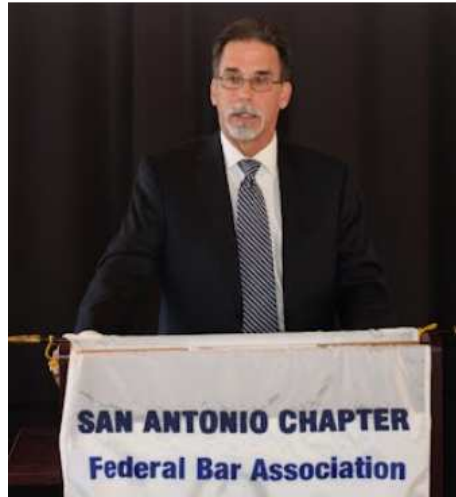
Judge Craig Gargotta, United States Bankruptcy Judge, March 2012