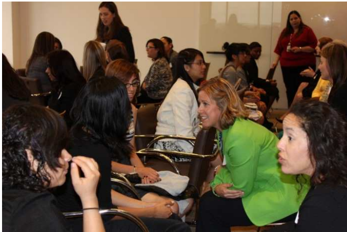
Students and mentors visiting about career options

The newsletter for the San Antonio Chapter of the Federal Bar Association