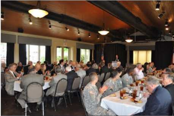
Our monthly luncheons at the Quarry Golf Club

The newsletter for the San Antonio Chapter of the Federal Bar Association