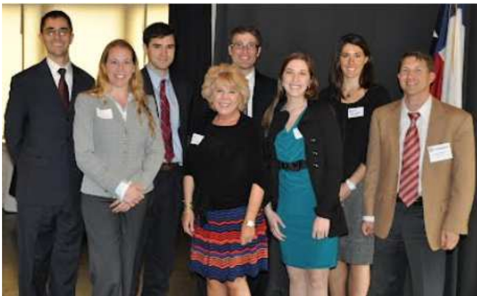
Honoring St. Mary's Law School Students Lucien Campbell Award recipients